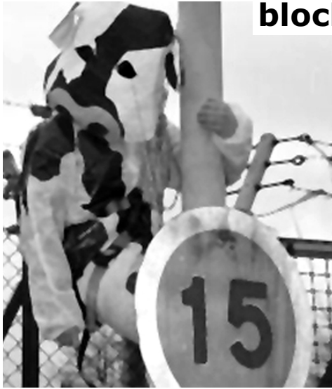
Cow scales lampost in Basingstoke

On Feb 22 nd five of supermarket chain Sainsbury's Regional Distribution Centres (RDCs) were simultaneously blockaded. The actions commenced at 10:30am blocking depots in Basingstoke, Hampshire; East Kilbride, near Glasgow; Elstree, North London; Maidstone, Kent and Stone, Staffordshire.