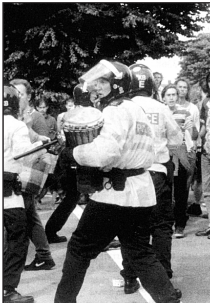
Cops go undercover at Brighton Street Party.

named 'Operation Oscar', cost over £100,000, and they can be proud of their contribution to obstructing the traffic in defence of Mother Earth. They can be less proud of their excessive use of batons and deficient use of brains.