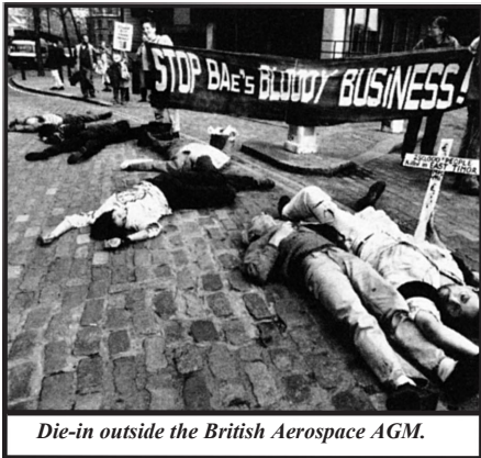
Die-in outside the British Aerospace AGM.

After this there was a rush at the stage as other activists attempted to mount the podium and meet the board. Some eggs were thrown and two people locked on. Security waded in and began to remove people. There were reports of heavy-handed treatment including activists being beaten up in the lift. Activists were also photographed by Security. Contact CAAT 0171 281 0297.