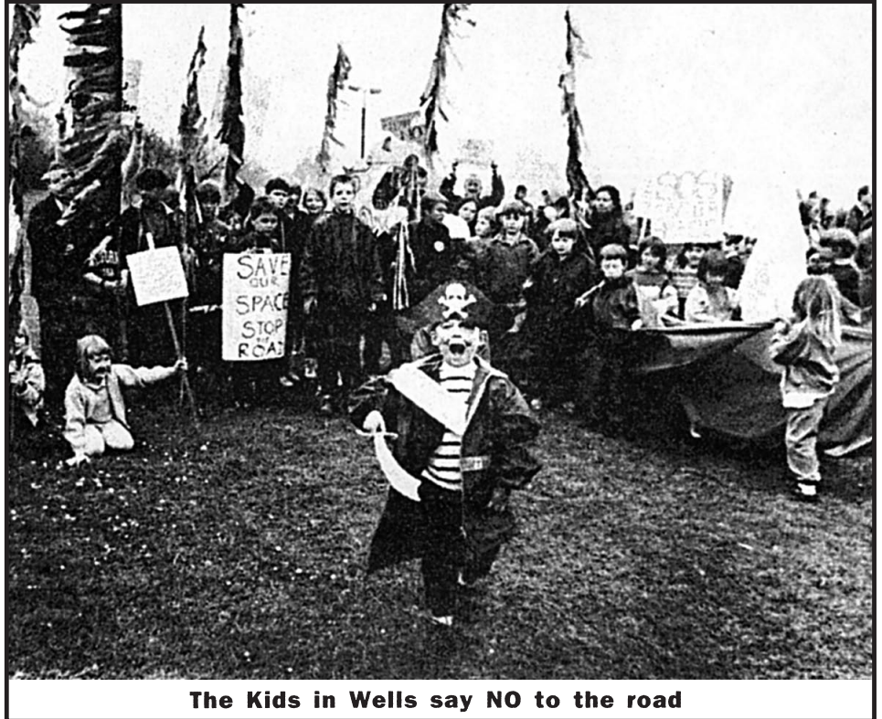
The Kids in Wells say NO to the road

Things are quieter at Selar now. A permaculture garden and compost loos are being constructed. There is no