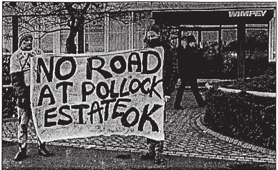
The construction workers arrived to find other local Freedom Network Groups.

On March 14th 1994 construction of the Swainswick and Batheaston bypass was due to start.